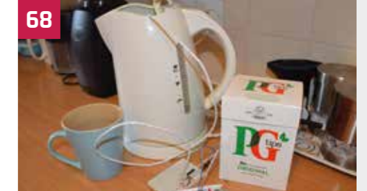
Power up your kitchen