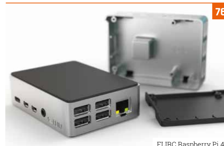
FLIRC Raspberry Pi 4