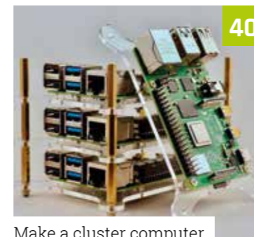
Make a cluster computer

DISCLAIMER: Some of the tools and techniques shown in The MagPi magazine are dangerous unless used with skill, experience, and appropriate personal protection equipment. While we attempt to guide the reader, ultimately you are responsible for your own safety and understanding the limits of yourself and your equipment. Children should be supervised. Raspberry Pi (Trading) Ltd does not accept responsibility for any injuries, damage to equipment, or costs incurred from projects, tutorials or suggestions in The MagPi magazine. Laws and regulations covering many of the topics in The MagPi magazine are different between countries, and are always subject to change. You are responsible for understanding the requirements in your jurisdiction and ensuring that you comply with them. Some manufacturers place limits on the use of their hardware which some projects or suggestions in The MagPi magazine may go beyond. It is your responsibility to understand the manufacturer's limits.